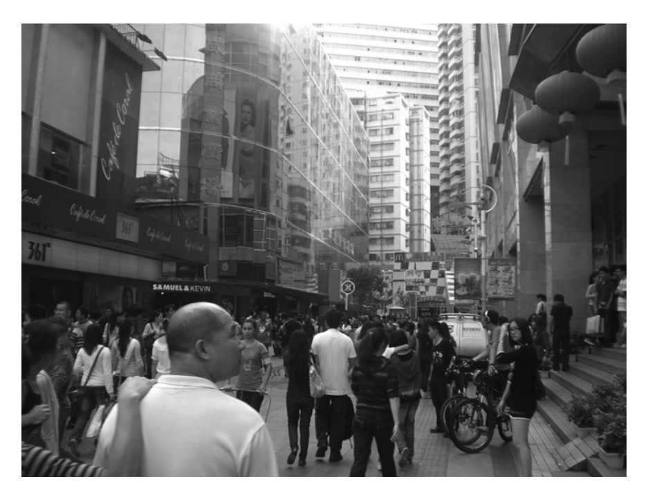
Figure 36.3 Dongmen Pedestrian Street, 2010, one of Shenzhen's most popular tourist destinations.