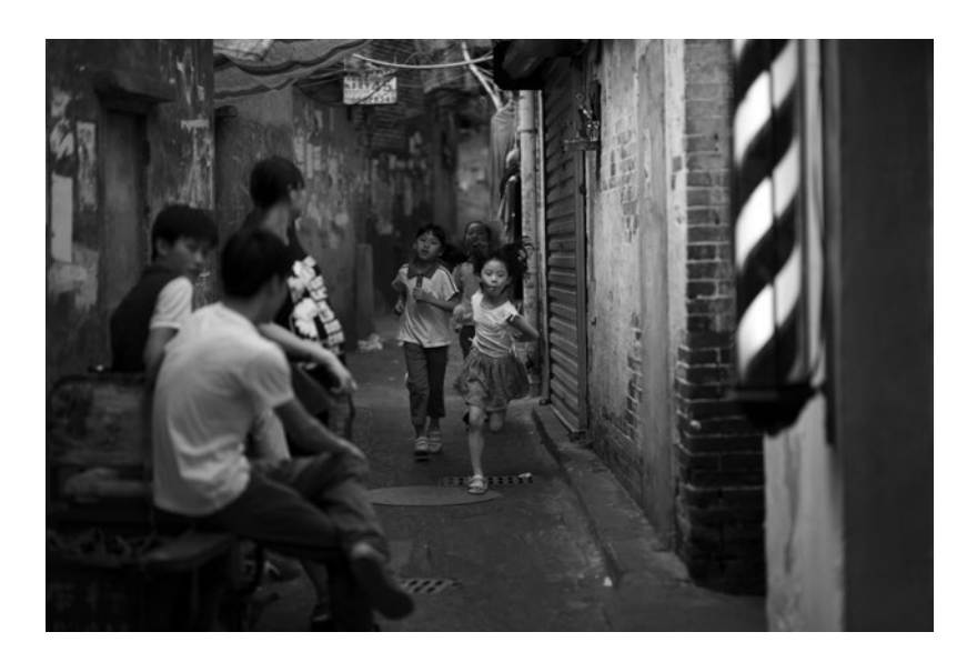
Figure 36.6 Everyday life in Old Hubei – children playing in an alleyway.