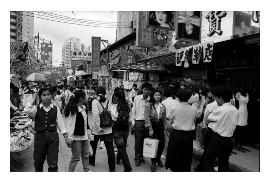
Figure 36.2 Historical Shenzhen Market, circa 1990. This photograph hints at the original layout of market streets as well as the pace of urbanization.