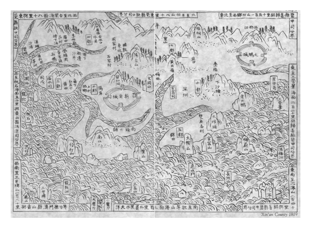
Figure 36.5 Gazetteer map of Xin'an County, 1819. The largest walled city on the map is "Xin'an County Seat" on the Nantou Peninsula.